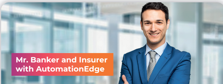
Mr. Banker and Insurer with AutomationEdge